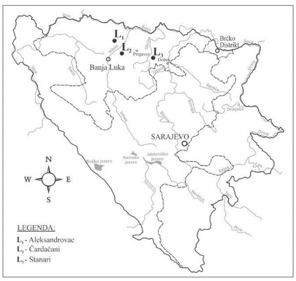
Fig. 1. Map of the research area with the sampling locations

The L1-Aleksandrovac location (N 44°58'33.9", E17°18'11.6") was a barley field, placed in the middle part of the Vrbas River valley, primarily utilized for crop and vegetable production. This point is about 25 km downstream from Banjaluka. Dominant soils here are fluvisoils (Mojičević et al., 1976). The second sampling location, L2-Čardačani, was black chokeberry orchard (N 44°52'35.0", E 17°19'23.7"), situated 20 km east from Banjaluka, in the zone of hilly terrains formed on the geological bedrock of limestone, marl, sandy, and loamy sediments (Mojičević et al., 1976). Orcharding, wine growing, and vegetable production are primary branches of agricultural production in the vicinity of this location. The sampling location L3-Stanari (N 44°44'43.45", E 17°46'11.18") was a meadow. This point is situated 25 km east from Doboj, near the small river stream which flows between the serpentine rocks (Sofilj et al., 1984) and 1.5 km away from the Stanari coal mine, exploited since the middle of the 20<sup>th</sup> century and a thermal power plant which started to work since 2016.